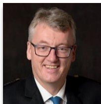
Professor Sir David W. C. MacMillan Catalysis Princeton University United States of America