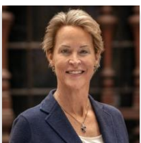
Professor Frances H. Arnold Chemistry Meets Biology for Health California Institute of Technology United States of America