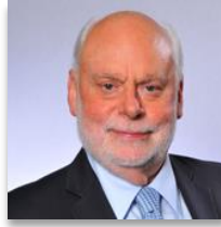
Professor Sir J. Fraser Stoddart Supramolecular Chemistry Northwestern University United States of America