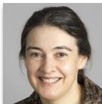
Professor Dame Clare P. Grey Energy, Environment and Sustainability University of Cambridge United Kingdom

The programme will cover such topics as: